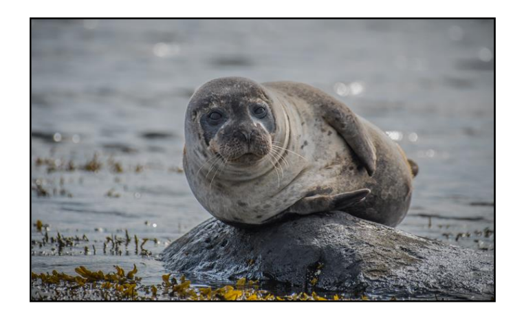
Day 1, 15<sup>th</sup> June 2020

The tour starts with a morning transfer to Reykjavik domestic airport from Reykjavik centre for a 45-minute flight to Akureyri .