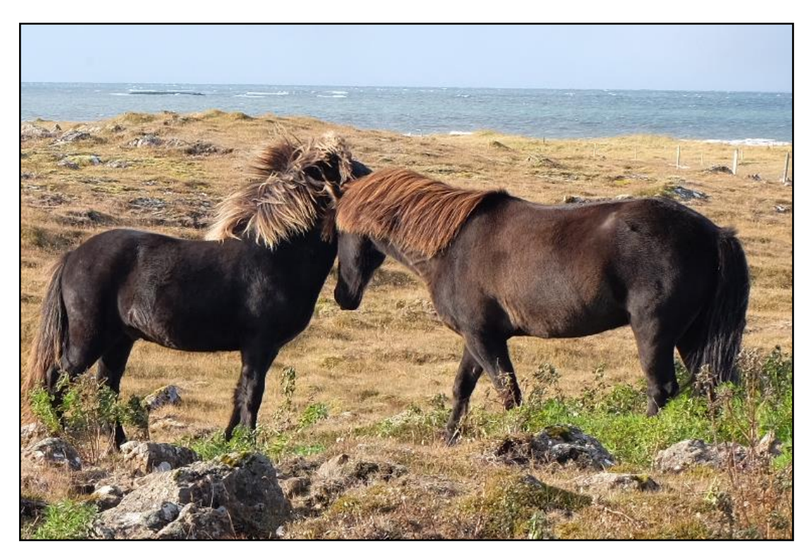
Night near Hvollsvöllur