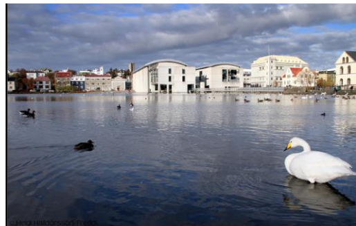
Reykjavik cathedral; soup in bread; downtown Reykjavik