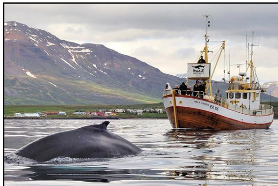
Geysir; Northern lights; Harlequin Ducks; Whale-watching