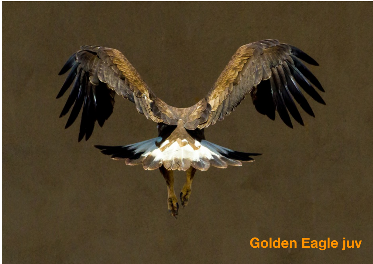
Golden Eagle juv

I took the AVANT train from Barcelona Sants station on 14 May at about 6 a.m. and arrived one hour